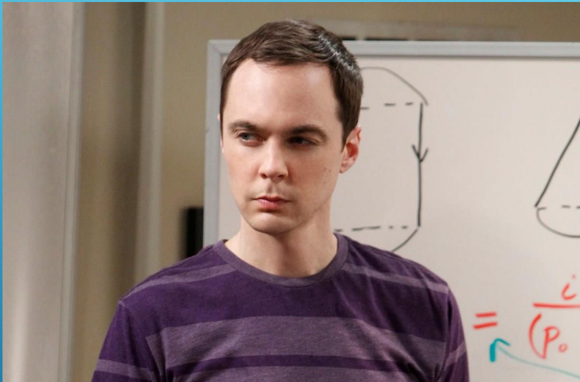
DR. SHELDON COOPER