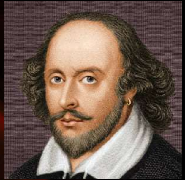
William Shakespeare As You Like It

All the world's a stage, and all the men and women merely players. They have their exits and their entrances, and one man in his time plays many parts... ”